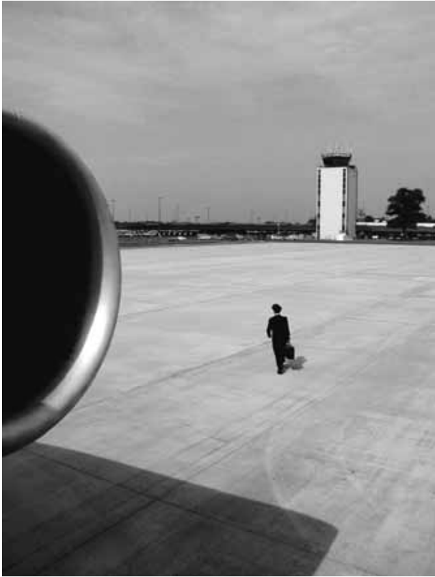
HONORABLE MENTION —“Final Flight,” by Jesse Black