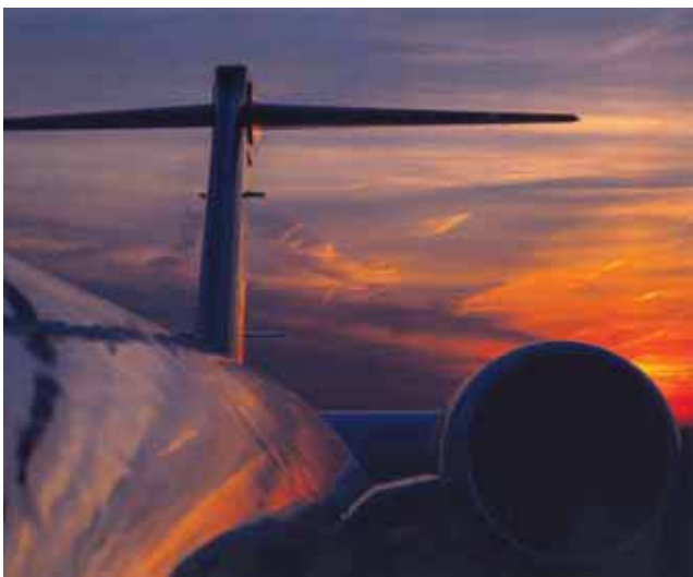
HONORABLE MENTION —“Last Night,” by Capt. Gwen Alletag (Comair)