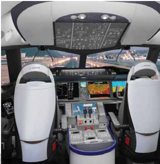
The B-787's "pilot-centered" flight deck was developed with significant input from ALPA pilots.

Boeing will manufacture the B-787 in three models: the B-787-8 (223 passengers for 8,500 nm), the B-787-3 (296 pas-