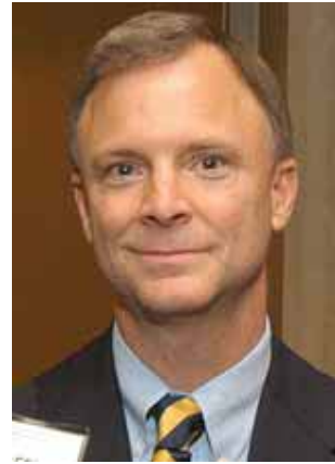
Capt. Robert Sumwalt

Capt. Sumwalt most recently served as chairman of ALPA’s Human Factors and Training Group. His previous