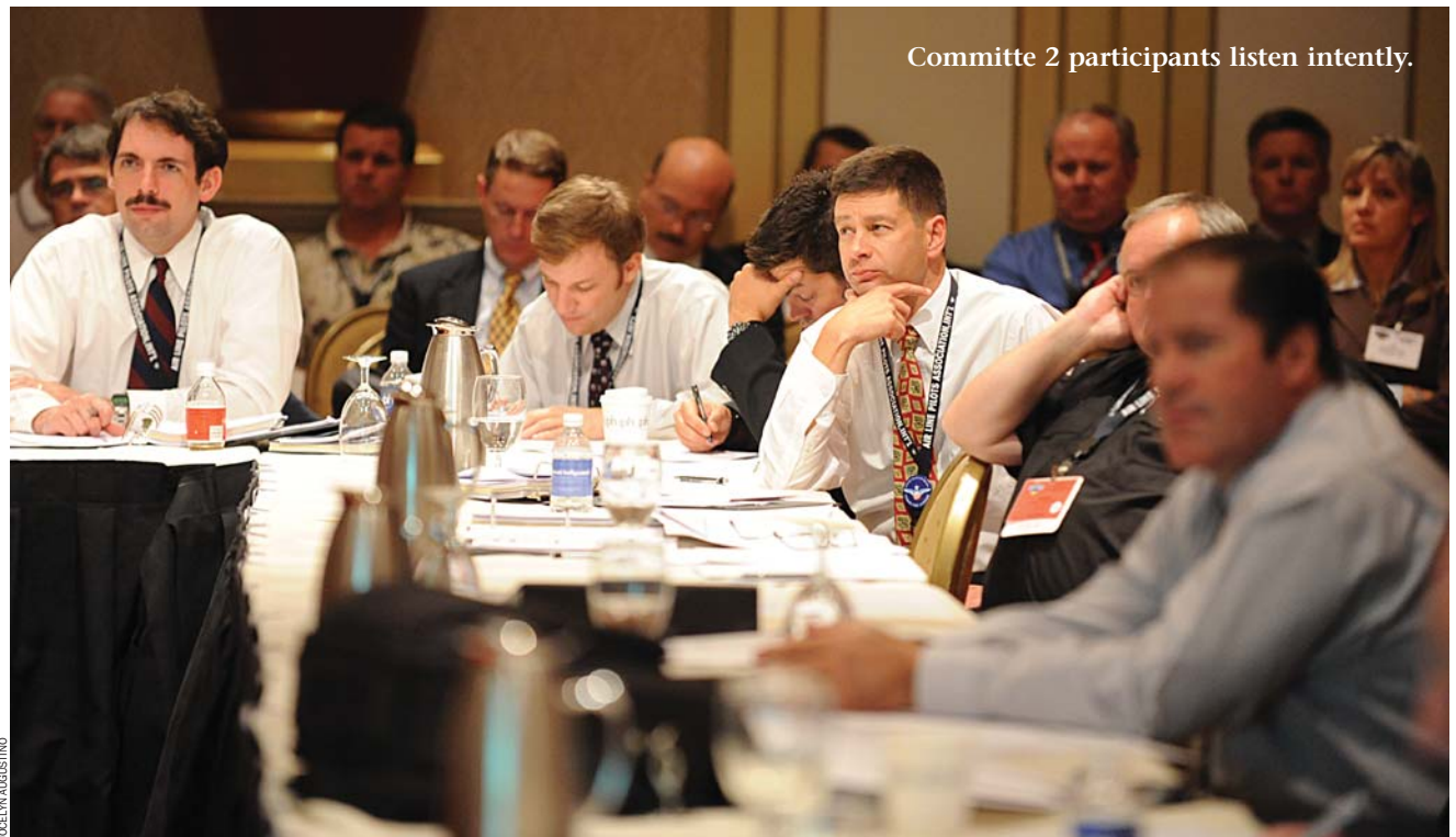
Committee 2 participants listen intently.